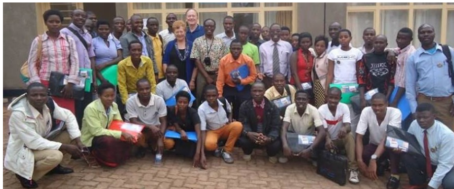
Participants in Rwanda Seminar on HIV & AIDS