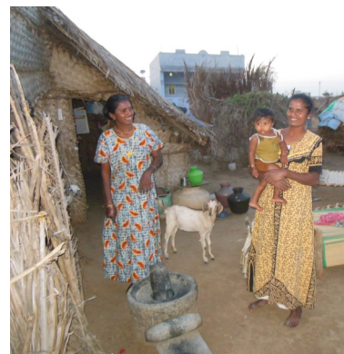
Visit families living with HIV