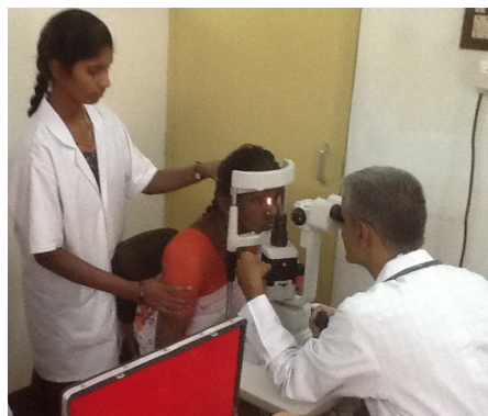
See eye clinic helping patients

Did you know circumcision can reduce male HIV infection rates by 60%? Rwanda is circumcising two million men over age of 18. Still should use condoms.