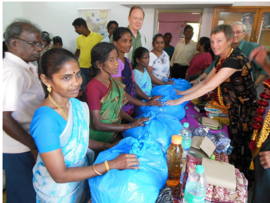
Help distribute food to the hungry