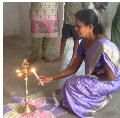
Light a candle of hope