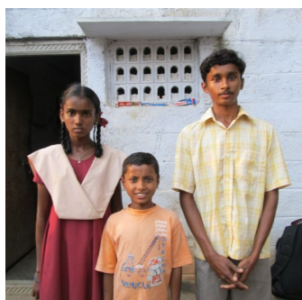
Meet a child-headed household

Did you know circumcision can reduce male HIV infection rates by 60%? Rwanda is circumcising two million men over age of 18. Still should use condoms.