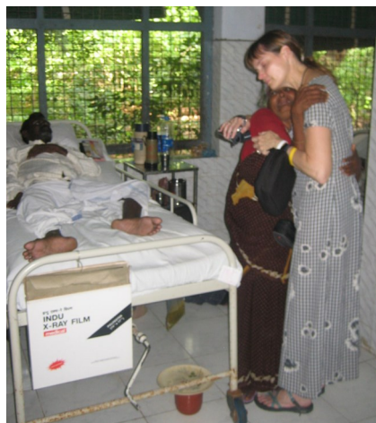
Share compassion & care