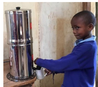
Kenya girl gets first clean water!