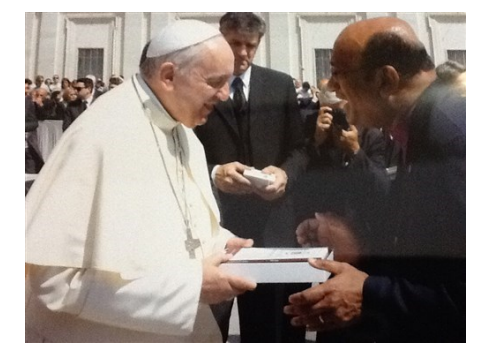
(Pope Francis received copy of Messer's book in St. Peter's Square from Bishop Sudarshana, Boston)