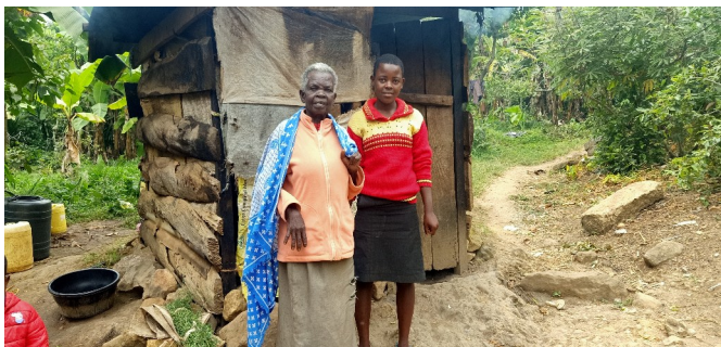
One room shack replaced by two room house with solid foundation.

For $3,000 a home can be built for an impoverished grandparent caring for their grandchildren orphaned by AIDS in Africa. Church members in Estes Park started out building one home at Christmas but ended up raising money to build five! A young man in South Dakota heard his aunt was building one, so he also gave $3,000. A couple in Georgia has pledged to build a home every year. Thanks to these persons and other donors, the Center is currently building sixteen homes! What about you?